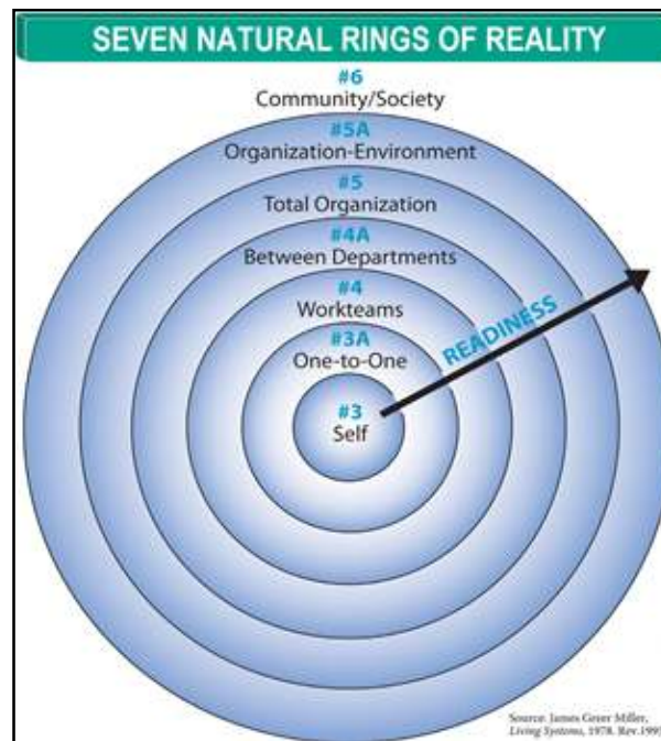
Figure 2: Seven Natural Rings of Real

Governance is necessary at every level of the Seven Levels of Living Systems or Natural Rings of Reality (see Figure 2 below). Each level has its governance authority. Just as natural systems have a hierarchy, so do our human systems. In the work team or group level (Level # 4); the team leader is accountable for governing. In intergroups (Level # 4A), the division leader is generally accountable for governing. In the total organization (Level # 5), the CEO is accountable for governing. In Level # 5A, accountability for governing is usually held by a Board of Directors.